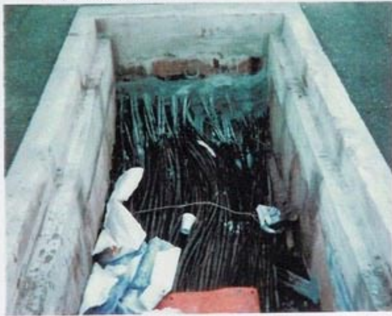
Overall view of completed job. The FX-III Jet Set remains flexible and will provide a watertight seal.