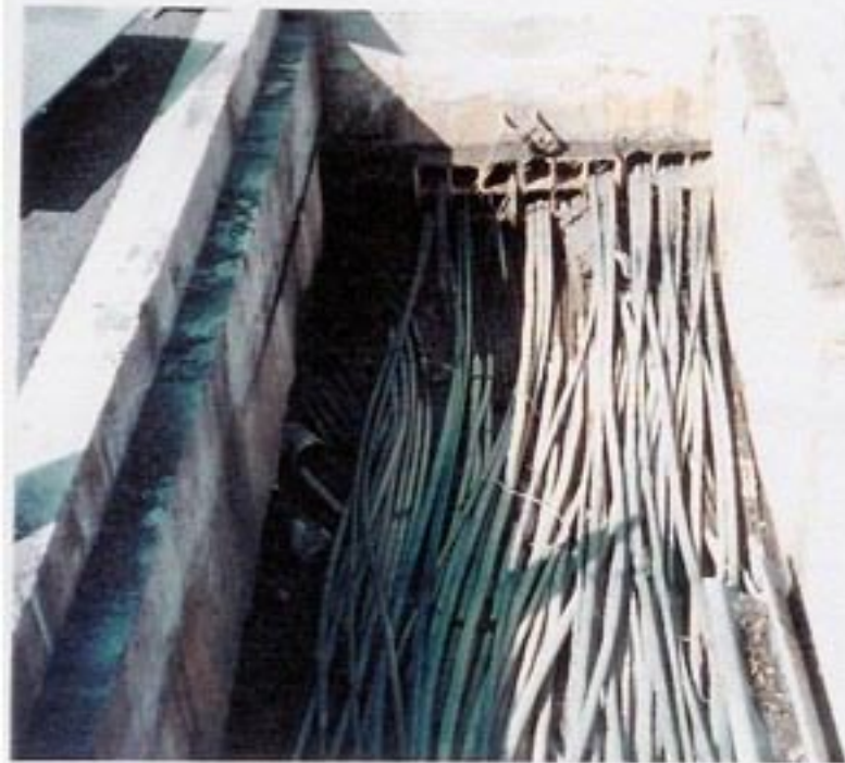
Overall view of vault containing open electrical ducts.