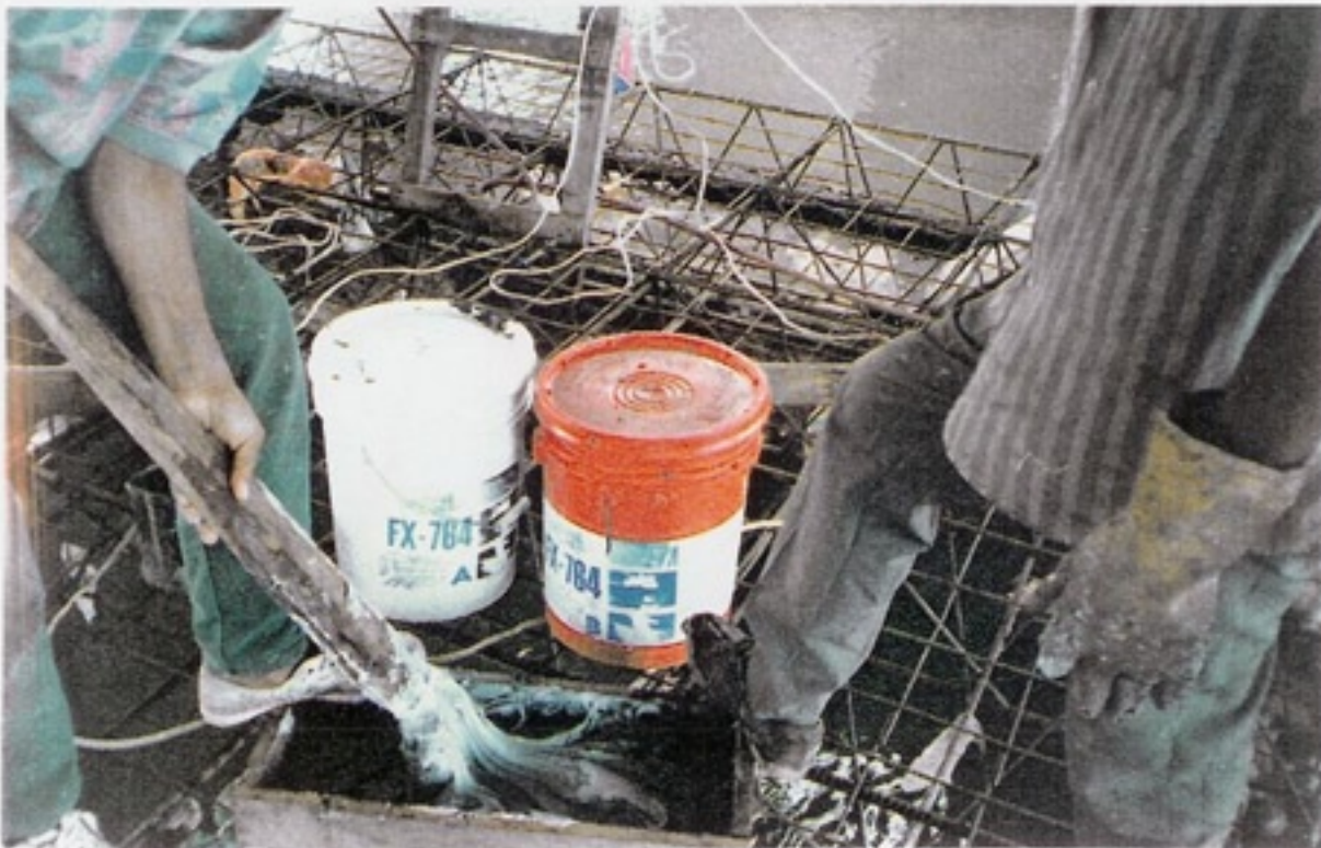
Mixing of FX-764 Hydro-Ester® Splash Zone Epoxy is simple and easy. The 1 to 1 ratio material, after mixed, is lowered under water and applied to concrete.