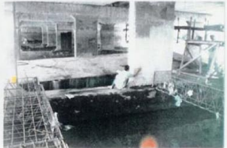
Surface preparation on under side of bridge.