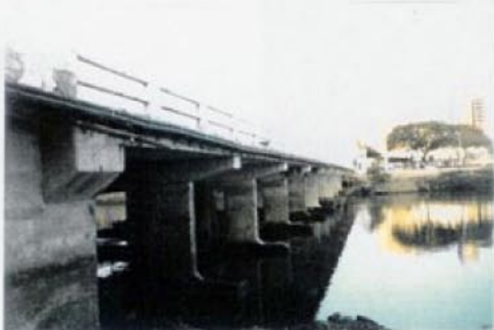
Overall view of bridge in Ecuador.

Rigail Productos & Servicios of Ecuador, South America, selects and recommends the use of Fox Industries FX-764 Hydro-Ester® Splash Zone, applied under water, and FX-498 Hydro-Ester® High Build Coating to protect concrete from further deterioration.