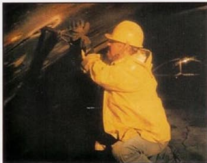
Under supervision of a Fox Industries Technician, with a minimum of 5 years of experience, contractor drills holes and sets grout packers at pre-determined locations.