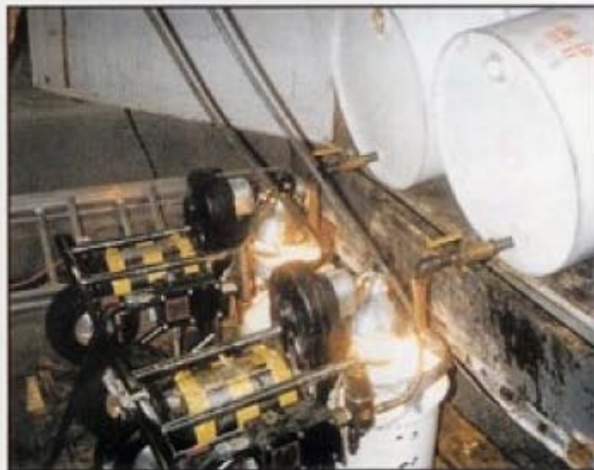
FX-III Jet Set is dispensed into pumping equipment that will meter the flow of Jet Set to the packers.