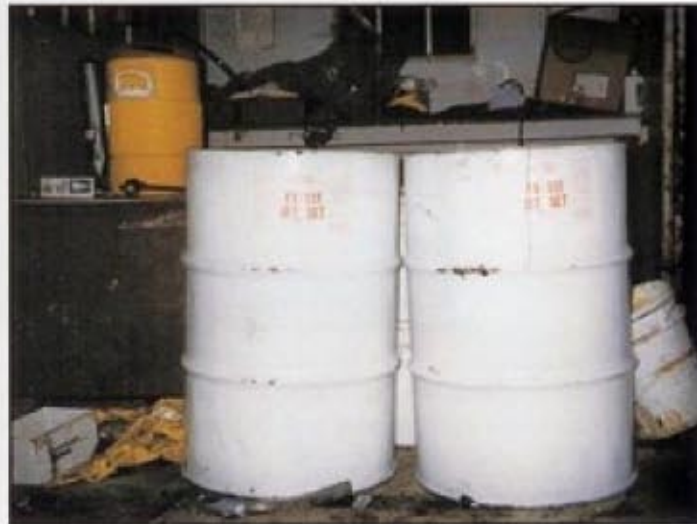
Contractor (Western Well & Pump Co.) requested FX-III Jet Set to be packaged in 55 gallon drums, due to the large quantity needed to complete the leak repair. Packing in drums also helps alleviate storage problems and excess containers, making it easier to dispose of complying with E.P.A. regulations.