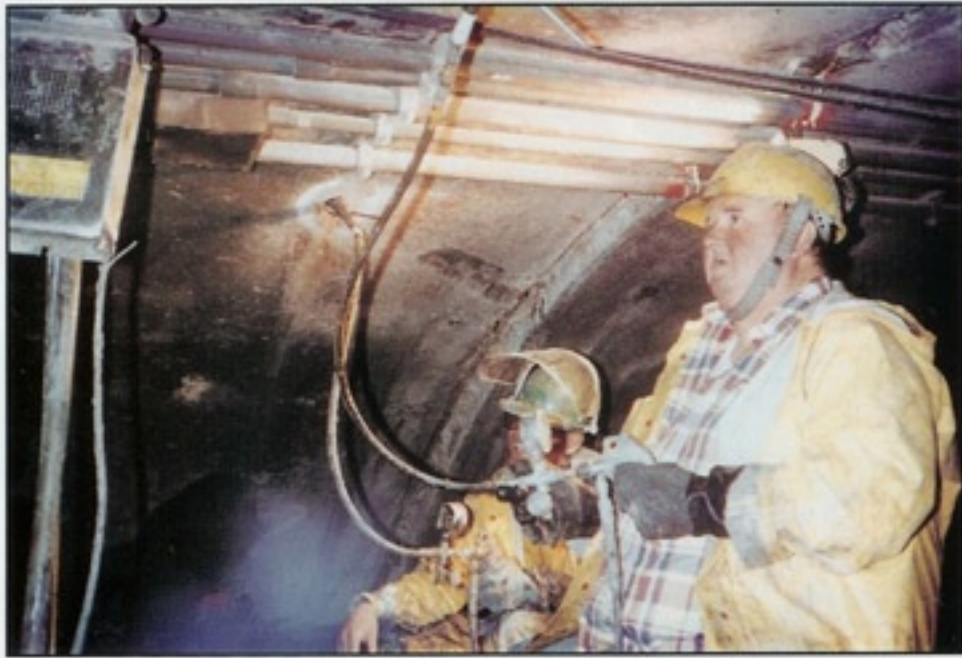
Pumping technicians monitor travel and amount of FX-III Jet Set through pump lines and packers. Over 4,000 gallons of FX-III Jet Set was used to seal leak in tunnel liner located above the vent shafts.