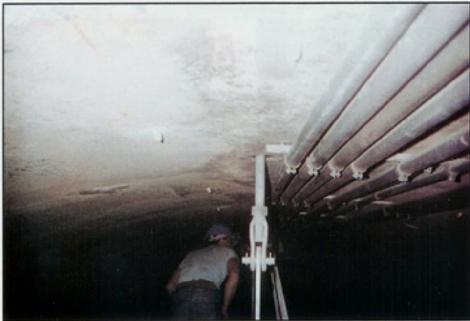
View of vent shaft section showing repaired leaks. FX-III Jet Set not only seals the water leaks in a matter of minutes. It also keeps the areas dry for years.